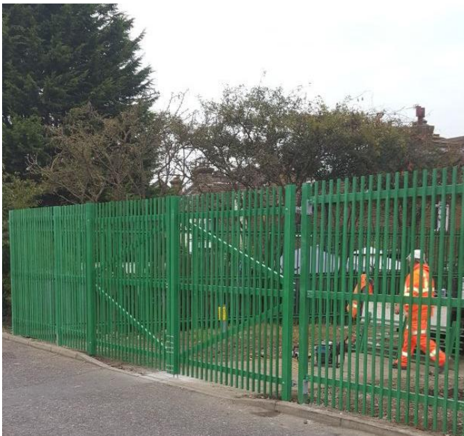
GRP Palisade Fencing