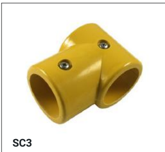
3 Way T Connection SC-CN-3W-90-YE

90° joint, often used to join intermediate uprights to top rails on level sites. This fitting can be used where through tube (horizontal in photo) has to be joined within the fitting. Where such a joint is not required, SC1 can often be used as an alternative.