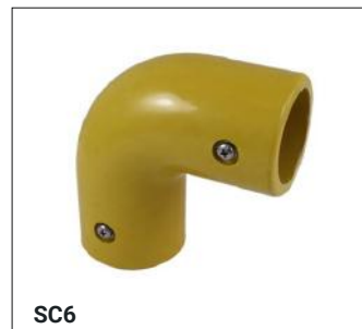
90 Degree Elbow SC-EB-2W-90-YE

90° corner joint, often used on middle rail on level sites and often paired with a 3-way Corner (SC1)