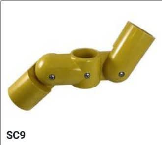
4 Way Universal Joint SC-UJ-4W-YE

A versatile swivel fitting, useful for awkward applications where angles cannot be accommodated by angle fittings. The through-tube cannot be joined within the fitting.