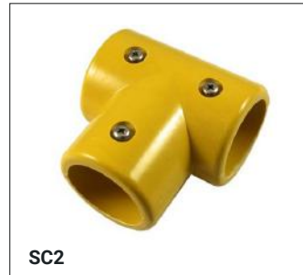
3 Way Long T Piece SC-LT-3W-90-YE

90° corner fitting, often used where top rail meets corner upright on level sites. Often paired with type SC5.