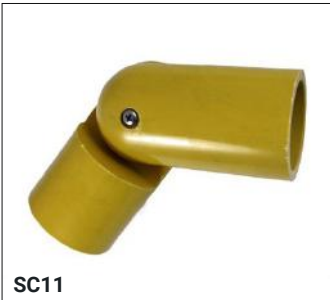
Universal Joint SC-UJ-2W-YE

A versatile swivel fitting, useful for awkward applications where angles cannot be accommodated by adjustable angle fittings.