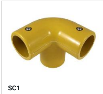
3 Way Corner SC-CR-3W-90-YE

90° corner fitting, often used where top rail meets corner upright on level sites. Often paired with type SC5.