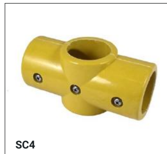
4 Way Connection SC-CN-4W-90-YE

90° butt joint, often used to join intermediate uprights to top rails and middle rails to end uprights on level sites. This fitting cannot be used where through tube (horizontal in photo) has to be joined within the fitting