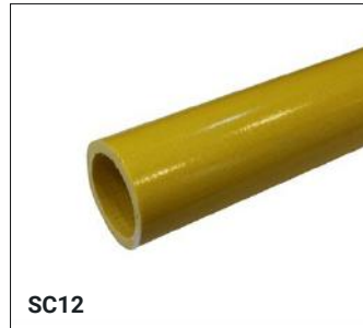
Safeclamp Tube SC-RT-50-50-05-YE

A versatile fitting, often used where a horizontal rail is joined to a sloping section