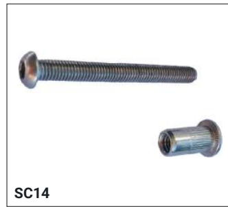
Safeclamp Bolt Set

A GRP toe board profile. 150mm High by 15mm thick.