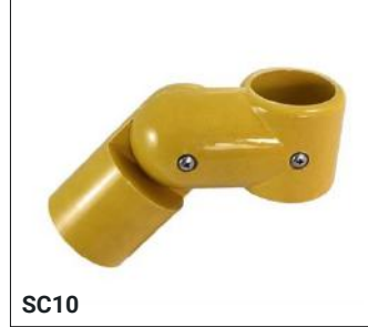
Universal 3 Way SC-UJ-3W-YE

A versatile swivel fitting, useful for awkward applications where angles cannot be accommodated by angle fittings. The through-tube cannot be joined within the fitting.