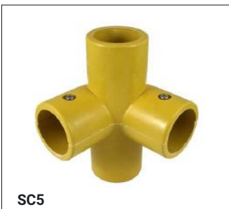
4 Way Corner SC-CR-4W-90-YE

90° joint, often used between mid-rail and uprights on level sites and often paired with type SC3 or SC2. The through tube (vertical in photo) cannot be joined within the fitting