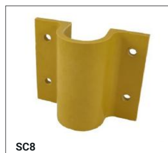
Sidemount Bracket SC-BK-SM-YE

Base flange, usually used for uprights on level sites. 12mm Diameter Fixing holes suit a wide range of common mechanical and chemical masonry, which are available upon request.