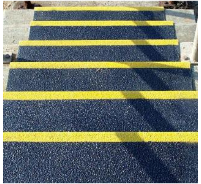
Stair Tread Covers