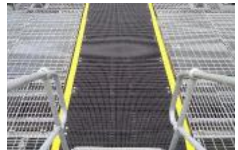
Roof Top Walkways