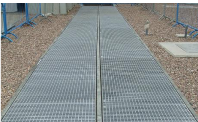
Fibreglass Open Mesh Grating